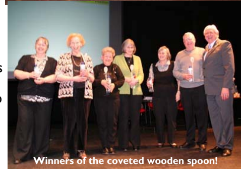
Winners of the coveted wooden spoon!