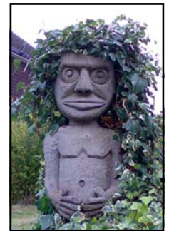
Hair today green tomorrow!!

The team came a glorious 3 rd out of three in the first race but improved to second next time round. With a 3 rd in the final paddle we didn't qualify for the knockout tournament. For a first go we acquitted ourselves well and if we can build on the enthusiasm of the paddlers this time we will do better next year. Some more positives were that some good contacts were made on the day and we expect to have raised in excess of £1,500 for the event – you know how long it takes to get sponsorship in sometimes!