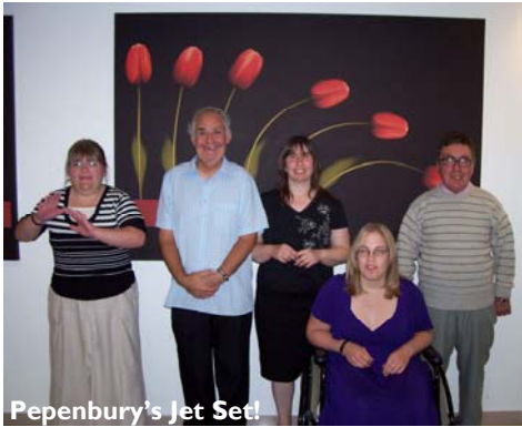
Pepenbury's Jet Set!